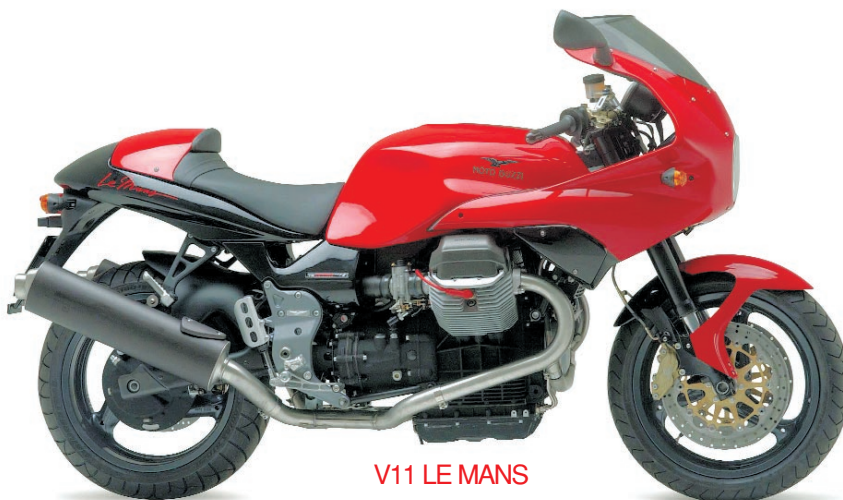
V11 LE MANS