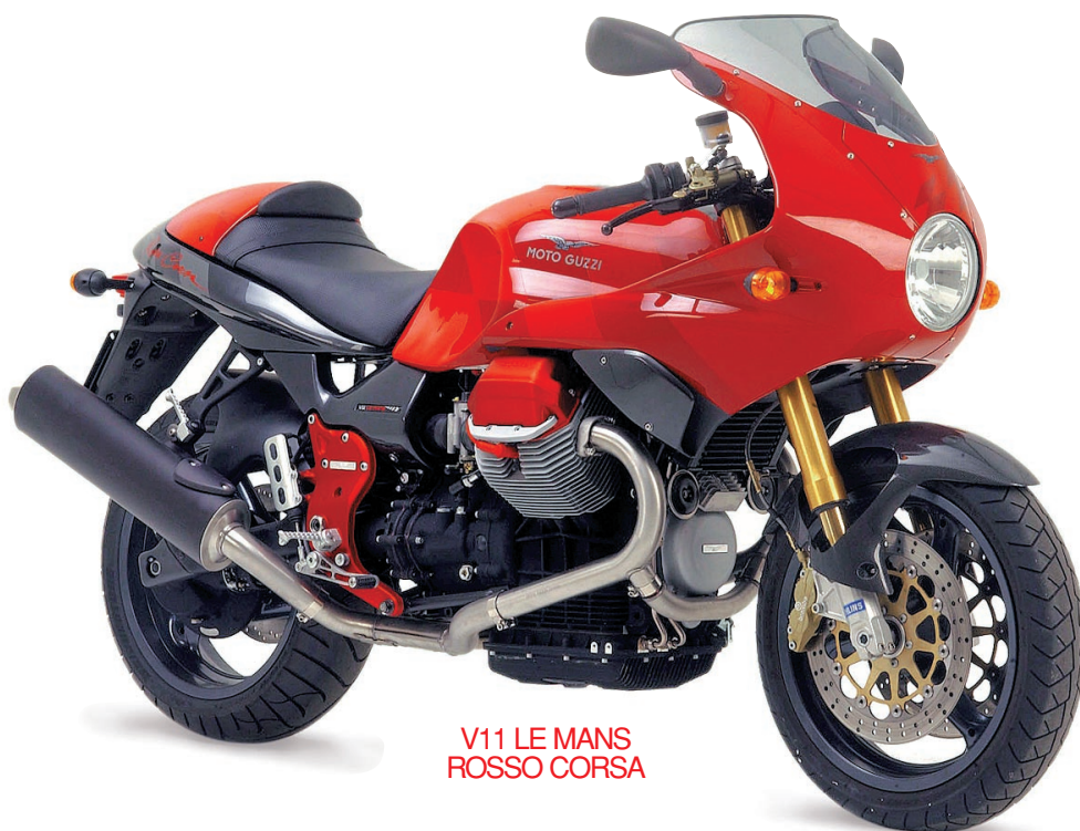
V11 LE MANS ROSSO CORSA

V11 Le Mans Rosso Corsa -- The flagship of the V11 Series. Admire the checkered-flag motif in the traditional Guzzi red tank-the only thing subtle about this muscle machine. The latest 90° V-Twin with added crossover pipe and increased compression ratio to 9.8:1. Brembo Gold Series brakes and Ohlins suspension.