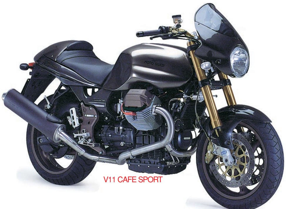
V11 CAFE SPORT

V11 Cafe Sport -- Cafe styling with a higher mounted handle bars for a more relaxed riding position. The latest 90° V-Twin with added crossover pipe and increased compression ratio to 9.8:1. Brembo Gold Series brakes, Ohlins suspension, carbon fiber sidecovers, front fender and starter motor cover. Available in Bronze Black Gold.