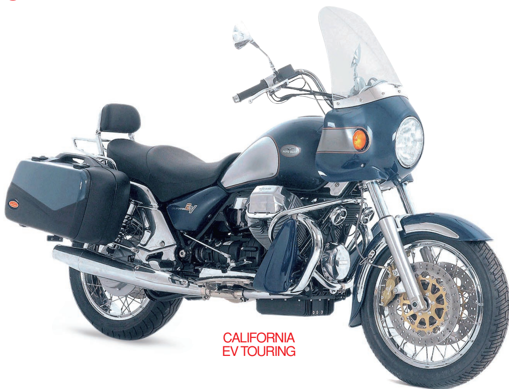
CALIFORNIA EV TOURING

California EV Touring -- The flagship of the EV series. Distinctively decked out with a rider's dream list of standard accessories, including an aerodynamic color-matched fairing and lowers, plus color-matched hard saddlebags, heated hand grips and a 12V accessory plug. New motor with hydraulic self-adjusting valves. Brembo Gold Series brakes. Integral braking system. Available in Black and Chrome, Red and Black, Blue and Chrome.