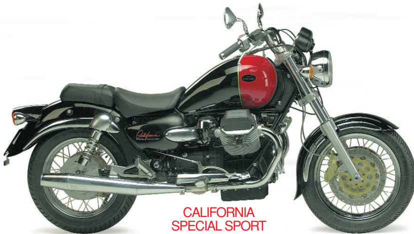
CALIFORNIA SPECIAL SPORT