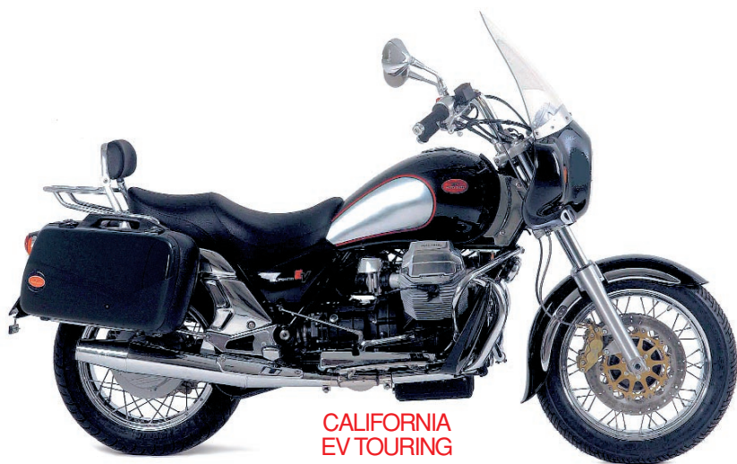
CALIFORNIA EV TOURING