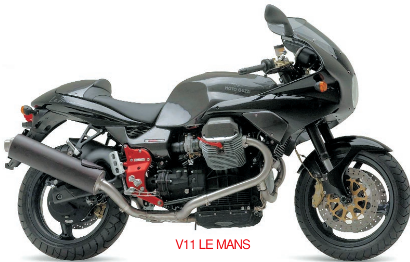
V11 LE MANS