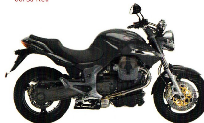
Sasso del Lario Gray Guzzi Black pictured on right