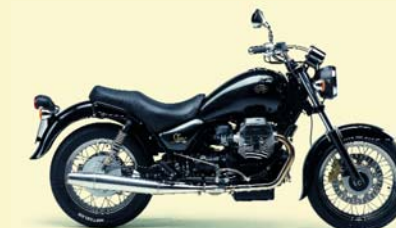
Nero Shadow (black)