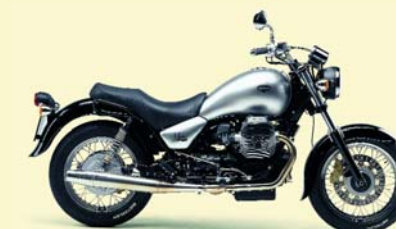
Grigio Platino (grey)