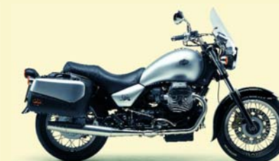
Grigio Platino (Stone Touring) (grey)