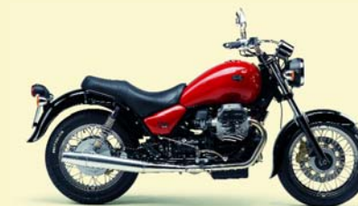
Rosso Race (red)