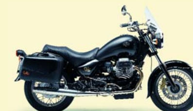
Nero Shadow (Stone Touring) (black)